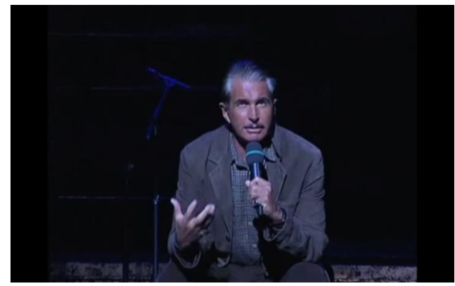
George Hamilton, Broadway and Film Actor, speaks at a Chicago Day on Broadway